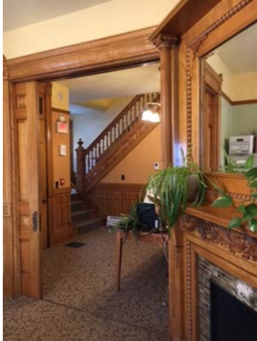
Entryway to NRB offices in Montpelier.

The NRB Executive Director undertakes managerial, administrative, and coordinating work for the Natural Resources Board, assists with policy formulation and goal setting, and is also responsible for the recruitment, training, and supervision of the State Coordinator and regionally based District Coordinators. The Executive Director is also involved in the preparation and delivery of statewide education and training for staff and appointed commissioners, development of publications and forms, and outreach to external partners and participants in the Act 250 process.